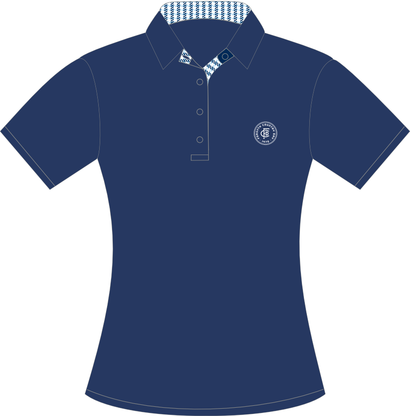
Navy/ Ice Blue

The layout is a graphic representation of garment and the artwork. Actual colors & sizing may vary