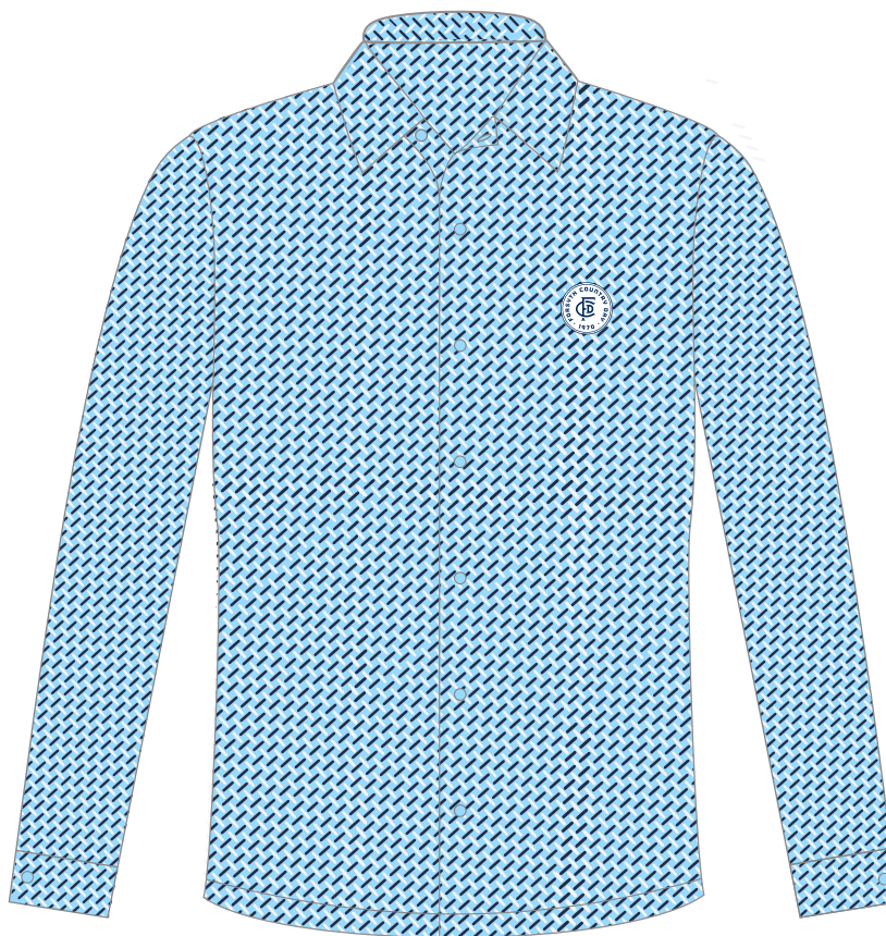
Serenity/ Navy & White

The layout is a graphic representation of garment and the artwork. Actual colors & sizing may vary